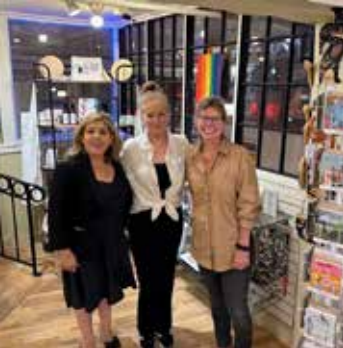
Visit Ventures in the Market

Here is another report about a recipient of a Plymouth Community Investment loan, following the first such recent article in the July 5 Herald . This time I will tell you about Ventures, a local Seattle non-profit which encourages low-income entrepreneurs (VenturesNonprofit.org). Ventures provides “access to business training, capital, coaching, and hands-on learning opportunities. We serve those in our community for whom traditional business development services are out of reach, with a focus on women, people of color, immigrants, and individuals with low income. Our ultimate goal is to support individuals to increase their income potential, achieve long-term financial stability, provide for their families, and enrich their communities through small business ownership.”