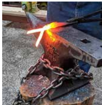
A rifle barrel is hammered into a trowel.

When the resolution “Affirming Guns to Gardens and Other Gun Violence Prevention Ministries” came to the floor of the United Church of Christ’s General Synod on the Fourth of July, support poured in. A former gun owner, a 911 operator, a delegate whose father had used a gun to commit murder, a former member of the military, a self-described conservative pastor and many more spoke in its favor. In fact, no one spoke against this resolution from the plenary floor.