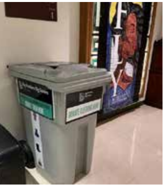
Bring gently used clothing and shoes.

Plymouth Church, UCC is now a proud sponsor of Big Brothers Big Sisters of Puget Sound. You can help by dropping off clothing and shoes at the church in the grey bin located by the elevator on the 1st floor. Gently used clothing and shoes of any size are appreciated. This is also an opportunity to help the environment by diverting used clothing from landfills.