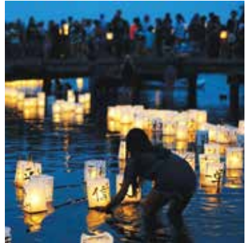
6 pm Sunday, August 6 at Green Lake.

Candle-lit lanterns will spark hope at Seattle’s annual lantern-floating peace ceremony on Sunday evening, August 6 at Green Lake, just south of the Bathhouse. Program includes music, poetry, dance and speakers. The event marks the anniversary of the atomic bombings of Hiroshima and Nagasaki, honoring all victims of violence. We also remember the incarceration of Japanese Americans on the U.S. West Coast.