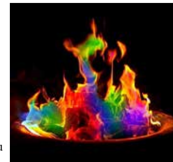
Help make this a year of jubilee!

Over a hundred million Americans, one in three, struggles with the weight of medical debt. Your donation helps lift the burden. Join us as we end medical debt for the most impacted in the Pacific Northwest, the South, and in places where the crisis of medical debt looms. Together, you and I can do the work of equity and justice, following the spirit to infuse freedom in the world.