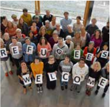
Protect the most vulnerable.