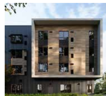
Latest Plymouth Housing building opens.

Plymouth Housing is proud to share our newest building with you! Located in the Eastgate neighborhood of Bellevue, Plymouth Crossing is our first building outside of Seattle and the very first permanent supportive housing on the Eastside. This project is truly a milestone in our mission to address the homelessness crisis—and proof that multifaceted, collaborative efforts make all the difference.