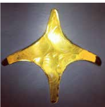
We are thankful for all your gifts.

Thank you for your faithful support of the mission and ministries of Plymouth United Church of Christ. Listed below are a variety of ways for you to provide offerings and gifts. Your support makes a difference.