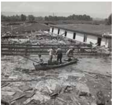
August 15-16. Register now.

We’ll visit the former site, hear firsthand accounts, and reflect on the enduring lessons of race, housing, and resilience in America. Plan to join us August 15-16. Register using the link in the news article at PlymouthChurchSeattle.org.