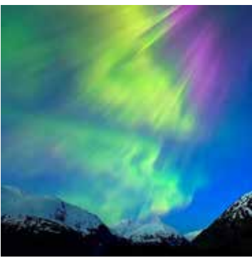
12 pm Sunday, August 17, at Plymouth.