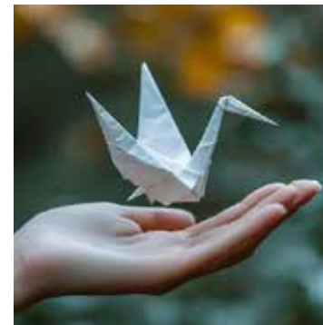
7:30 pm Sunday, Aug. 3, University UCC.

You are invited to University Church UCC (4515 16th Avenue NE, Seattle) 7:30 pm Sunday, August 3, to take part in “80 Years After Hiroshima: A Survivor Speaks, A Generation Walks,” an evening of testimony, song, and intergenerational reflection on the 80th anniversary of the Hiroshima bombing, followed