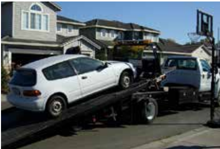
It's quick and easy! Visit CarEasy.org

CARS (Charitable Adult Rides & Services) is dedicated to helping non-profit organizations such as Plymouth Church raise thousands of dollars in vehicle donations through successful car donation programs.