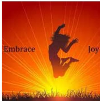
Register now for Women's Retreat Nov. 7-9

Whether you are a seeker, skeptic, believer or somewhere in between on life’s journey, you are welcome here. We are grateful for your presence and invite you to participate in worship and service of Plymouth Church UCC.