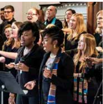
All voices welcome in Plymouth Choir.