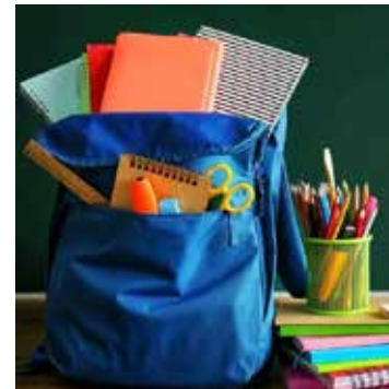
Please bring school supplies on Sundays.

The Community and Care Board will collect donations of school supplies every Sunday now through September. Supplies will go to Urban Impact, a local organization dedicated to helping people and communities thrive. Through their youth program, they'll distribute items to kids who might otherwise go without. Please, help us help more kids get off to a great school year. All donations are appreciated. Supplies most needed are: