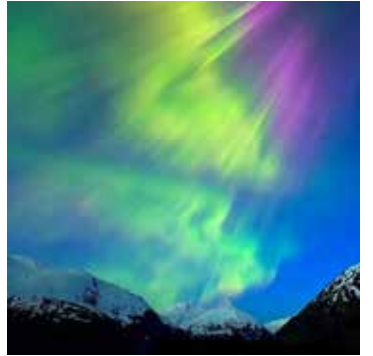
12 pm Sunday, August 17, at Plymouth.