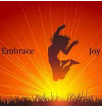
Register now for Women’s Retreat Nov. 7-9

The Pacific Northwest & Central Pacific Conferences of the United Church of Christ join together every three years to offer a spiritual and motivational women’s retreat. What a perfect time to Embrace Joy! Come and take time just for yourself. Breathe deeply, relax fully, and explore, enrich, and rekindle your spirit. The retreat theme for 2025 is “Embrace