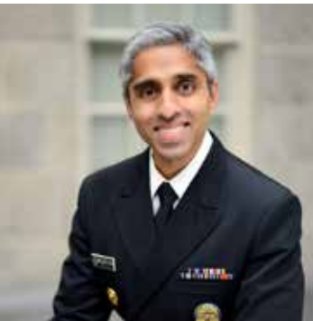
Keynote speaker Dr. Vivek Murthy

As one of the largest providers of permanent supportive housing in King County — and with a 95% success rate of helping people exit homelessness for good — Plymouth plays a vital role in ensuring our neighbors have the homes and support they need to thrive. This year’s event will explore how human connection is essential to healing, stability, and long-term well-being — especially for those who have experienced homelessness. Together, we can build a future where no one is left behind.