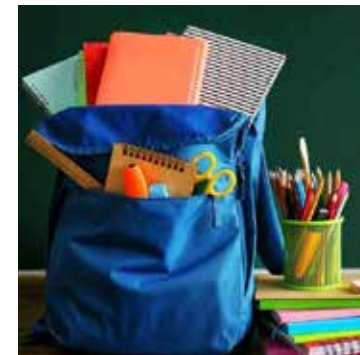
Please bring school supplies on Sundays.

The Community and Care Board will collect donations of school supplies every Sunday now through September. Supplies will go to Urban Impact, a local organization dedicated to helping people and communities thrive. Through their youth program, they'll distribute items to kids who might otherwise go without. Please, help us help more kids get off to a great school year. Supplies most needed are: