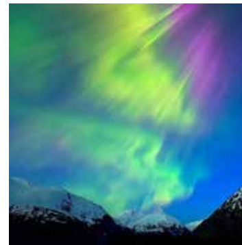
12 pm Sunday, August 17, at Plymouth.