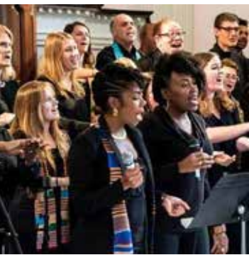
All voices welcome in Plymouth Choir.

Plymouth Choir will reconvene 5-7 pm Monday, August 25, for a choir retreat to refresh our souls through the power of music. We will meet in Hildebrand Hall to sing through upcoming pieces and share a potluck dinner afterwards, enjoying friendship, connection, and nourishing food. If you have always wanted to sing in a choir, this is the first of many opportunities to add your voice and make music with us.