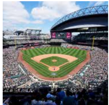
Ticket purchase benefits Plymouth Housing

The Seattle Mariners are teaming up with Plymouth Housing for a special night of baseball and community. Join us Friday, August 22, for the Mariners vs. Oakland Athletics game and support our work to end homelessness in the region. Through Home Runs To End Homelessness, a portion of every ticket sold will benefit Plymouth Housing.