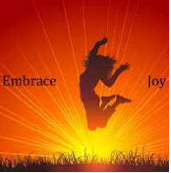
Register now for Women’s Retreat Nov. 7-9

Learn more and register now at NRWR.org .