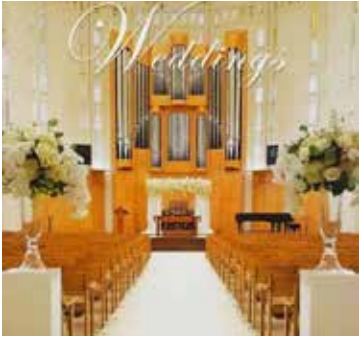
Plan your wedding with Plymouth.

Read more at PlymouthChurchSeattle.org .