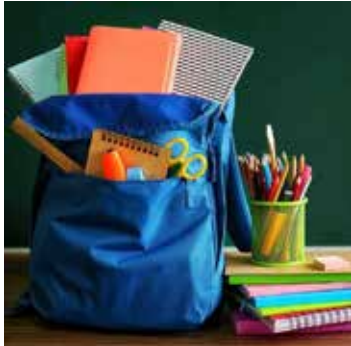
Please bring school supplies on Sundays.

Donations of school supplies are still being collected every Sunday. Please leave them in the bin by the Welcome Table in the Lounge. Supplies will go to Urban Impact, a local organization dedicated to helping people and communities thrive. See list of most requested items in the news article at PlymouthChurchSeattle.org. 🌍