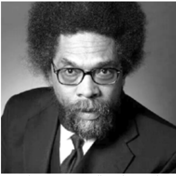
Cornel West at Town Hall Seattle September 6.

As the nation faces significant turmoil and division, faith institutions have a unique role to play in healing the national rupture. Valley and Mountain Fellowship—a progressive faith community—is committed to helping create a more just world. In service of this mission, the Fellowship has invited noted public intellectual Cornel West to share his wisdom with the community. The event serves as a fundraiser for the Center for Faith, Art, and Justice. 🌍