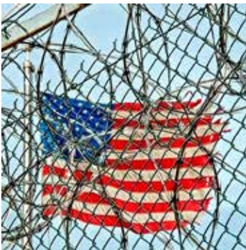
September 7 at Seattle First United Methodist.

The Church Council of Greater Seattle invites you to a special presentation of Detention Lottery 4 pm Sunday, September 7, at Seattle First United Methodist Church (180 Denny Way, Seattle).