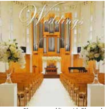
Plan your wedding with Plymouth.

If you or someone you know is planning a wedding, we invite you to attend the Seattle Wedding Show with a special discount from Plymouth. The show is held Jan. 31–Feb. 1, 2026, at the Convention Center (705 Pike Street).