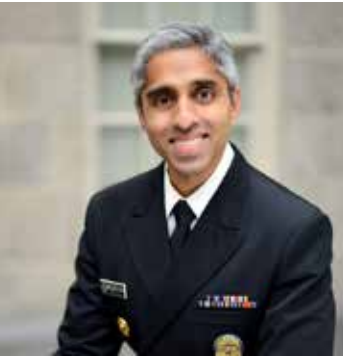
Keynote speaker Dr. Vivek Murthy

Support Plymouth Housing at Key to Hope: The Power of Connection , Noon–1:30 pm Wednesday, September 17, at the Seattle Westin downtown (1900 5th Ave). This inspiring event brings together forward-thinking community to take meaningful steps toward ending homelessness.