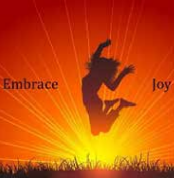
Register now for Women’s Retreat Nov. 7-9

The Pacific Northwest & Central Pacific Conferences of the United Church of Christ join together every three years to offer a spiritual and motivational women’s retreat. The retreat theme is “Embrace Joy” and registration is now open. Get set to join us November 7-9 for a fantastic event at Skamania Lodge in Stevenson, WA.