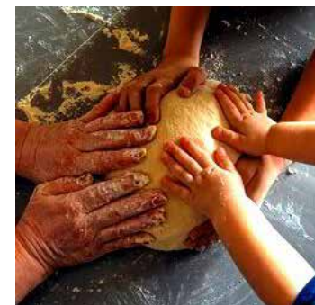
Join our first gathering September 11.

We will have monthly gatherings after worship for the whole community to engage together. We welcome people of all ages for homecoming Sunday, September 11! We will have a photo booth, as well as appetizers and live music out on the patio for coffee hour. Please join us in what will be a festive and celebratory time together. Read more about faith formation this church year in the August 24 issue of the Herald or online at PlymouthChurchSeattle.org . ✨