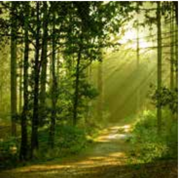
At Pilgrim Firs October 7-9.