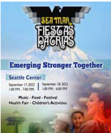
At Seattle Center September 17 & 18.

The festival is an important celebration for Sea Mar, founded by Latino community leaders in 1978. Sea Mar understands the barriers Latinos and other immigrants face when navigating the healthcare system, pursuing higher education, or simply trying to make a living. Sea Mar goes beyond primary care and has established additional programs, services, and events like Sea Mar Fiestas Patrias to celebrate Latino cultural traditions. ✨