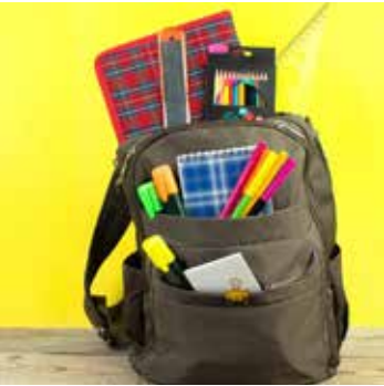
Please bring school supplies on Sundays.