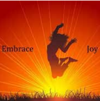
Register now for Women's Retreat Nov. 7-9