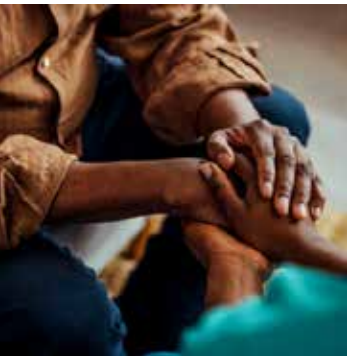
Join monthly online meetings.