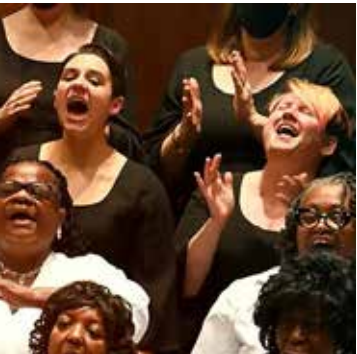
Lift your voice with Plymouth Choir.