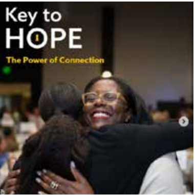
Register now at PlymouthHousing.org

Support Plymouth Housing at Key to Hope: The Power of Connection , Noon–1:30 pm Wednesday, September 17, at the Seattle Westin downtown (1900 5th Ave). This inspiring event brings together forward-thinking community to take meaningful steps toward ending homelessness.