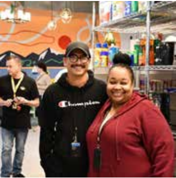
Thank you for helping tenants get settled.

Your contribution will stock the Plymouth Supply Center, where residents can shop for items free of charge. Whether it's a warm blanket, a fresh set of sheets or a comforting cup of tea, your donation helps residents feel at home. See two ways to give below.