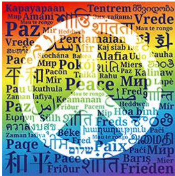
Share your prayers for peace at UCC.org.