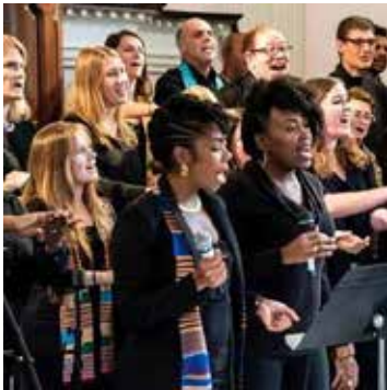
Make a joyful noise with Plymouth Choir.

The Seattle protest begins 12 pm, October 18, at Seattle Central College (1709 Broadway E). Keep reading for updates.