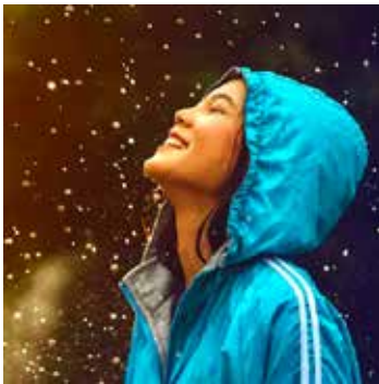
Register now for Women's Retreat Nov. 7-9

The Pacific Northwest & Central Pacific Conferences of the United Church of Christ join together every three years to offer a spiritual and motivational women's retreat. The retreat theme is "Embrace Joy" and registration is now open. Get set to join us November 7-9 for a fantastic event at Skamania Lodge in Stevenson, WA.