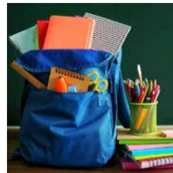
Please bring school supplies on Sundays.

Donations of school supplies are still being collected every Sunday. Please leave them in the bin by the Welcome Table in the Lounge. Supplies will go to Urban Impact, a local organization dedicated to helping people and communities thrive. See list of most requested items in the news article at PlymouthChurchSeattle.org. 🌍