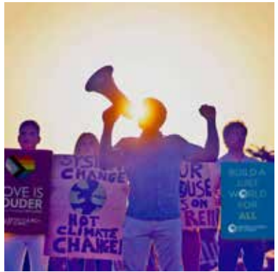
Thank you for your faithful support.

Join TINFA (Technology and Information for All) 6 pm Saturday, September 20, at Plymouth for dinner, drinks and live music as we celebrate all of the inspiring teachers and students at our partner schools in Guatemala. Visit Tinfo.org to learn more and reserve your place. 🌍