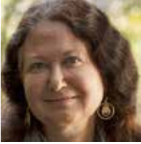
Jane Hirshfield is an American poet, essayist, and translator, known as ‘one of American poetry’s central spokespersons for the biosphere.’

And the Lord spoke to Moses, saying, “Speak to all the community of Israelites, and you shall say to them: ‘You shall be holy, for I the Lord your God am Holy.’”