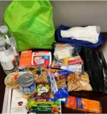
They will know us by our love.

The Community Care Board seeks donations to create Comfort Bags for our neighbors this fall. Items we are looking for: non-perishable snacks, facial tissue, hand sanitizer, lotion, socks, gloves, hats, toothpaste, toothbrushes, and other personal hygiene products. Please leave your donations in the basket at the Welcome Table in the Lounge. Thank you for helping us help our neighbors.