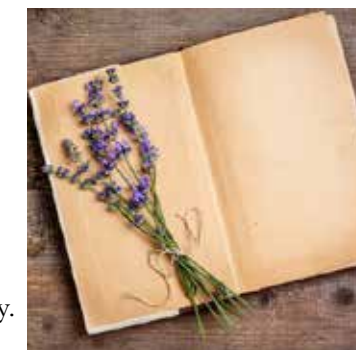
For all the saints who from their labors rest...

Add names using the online form (link in news article at PlymouthChurchSeattle.org) or sign the book in the Lounge. Please place an asterisk by names of those who have passed in the previous 12 months. Please send/sign names by Wednesday, October 29. 🌍