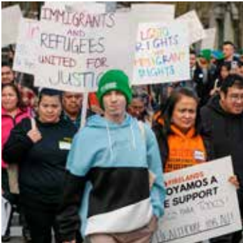
Stand in solidarity with migrant siblings.

Immigrant justice means creating a Washington where everyone—no matter where they come from—can live with dignity, access opportunity, and feel a true sense of belonging. Now more than ever, the Washington Immigrant Solidarity Network is doubling down on our commitment to providing unwavering support and resources to immigrant and refugee communities across the state.