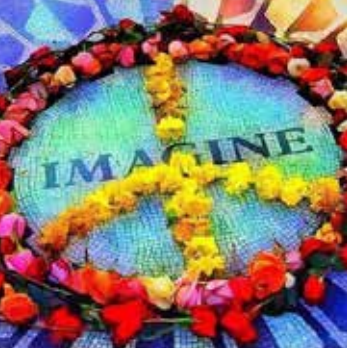
Share your prayers for peace at UCC.org .

The United Church of Christ extends an open invitation to anyone who feels called to offer a prayer to end violence in any manifestation, and to bring about peace. Read prayers and share your own at UCC.org/Peoples-Prayers-For-Peace . New prayers are published daily. The following prayer was recently shared by David C