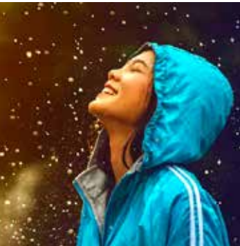
Register now for Women's Retreat Nov. 7-9

This open and affirming gathering warmly welcomes all who identify as women. Come and take time just for yourself. This is a retreat created for YOU. Learn more and register now at NRWR.org .