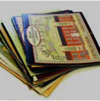
A simple gesture can mean so much.