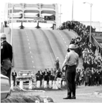
Learn about Bloody Sunday March 6-14, 2025.

Limit 26 persons. Register by Nov. 15. Details and registration link in the news article at PlymouthChurchSeattle.org .