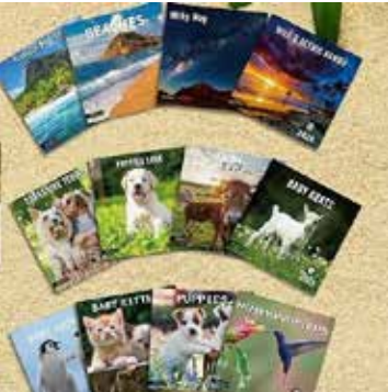
Your kindness makes a world of difference