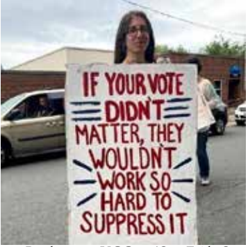
Read more at UCC.org/Our-Faith-Our

The U.S. House of Representatives advanced the Safeguard American Voter Eligibility Act which would require proof of citizenship status to register for federal elections. According to a study done by the Brennan Center for Justice, millions of American citizens don’t have the types of documents used to prove citizenship. States that passed voter ID laws are more likely to see significant racial turnout gaps on election day. These laws make it harder for voters of color and naturalized citizens to exercise their right to vote.