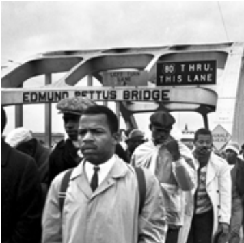
Learn about Bloody Sunday March 6-14, 2025.

The Selma Jubilee honors the anniversary of Bloody Sunday, which occurred on March 7, 1965, when 525 African-American demonstrators crossed the Edmund Pettus Bridge in Selma, Alabama, demanding their right to vote. They were violently confronted by more than 50 state troopers, horses, and posemen, who brutally attacked them when they refused to turn back. This shocking event was broadcast nationwide, revealing the grim reality of racism in the South. Two weeks later, Rev. Dr. Martin Luther King Jr. led 3,200 civil rights activists on a historic 49-mile march from Selma to Montgomery, helping spur the passage of the Voting Rights Act. Limit 26 persons. Register by Nov. 15. Details and registration link in the news article at PlymouthChurchSeattle.org . 🌍