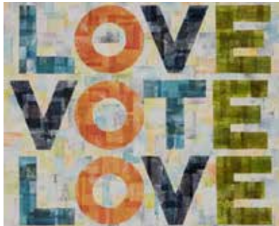
Art courtesy of Tracy Simpson

The United Church of Christ’s Our Faith Our Vote Campaign is our ongoing commitment to equip all with the tools for nonpartisan faithful engagement in our democratic process. The campaign is made up of three main components: voter registration, issue education, and voter empowerment.