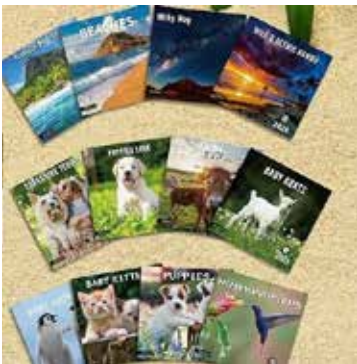
Your kindness makes a world of difference.