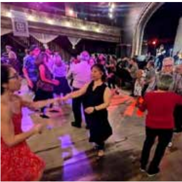
Thank you for your faithful support.

Holy trumpets on fire — Gimme Shelter 2024 was a huge success! Thank you to the almost 200 people who showed up and rocked out with us to the Dusty 45s in support of Downtown Emergency Service Center’s mission to end homelessness. We raised over $192,000 – coming SO close to reaching our fundraising goal of $200,000. There’s still time to donate. Visit DESC.org to help us achieve our goal.