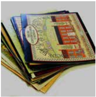
A small gesture makes a big difference.