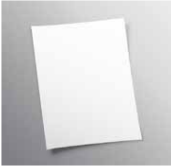
Plymouth Library is open every Sunday.

Contribute to Plymouth's campaign, "Licks of Fire" by clicking the button on the homepage at PlymouthChurchSeattle.org . Deadline to donate is November 1! 🌍