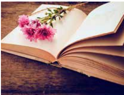
For all the saints who from their labors rest...

All are invited to bring pictures of loved ones who have passed to place on the chancel table on All Saint's Sunday. 🌍