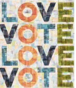
Art by Tracy Simpson

In peace and gratitude, Tracy Simpson, Plymouth Moderator 🌍