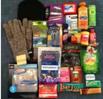
Bring items and help make care bags.