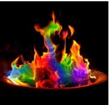
You can make this a year of jubilee!