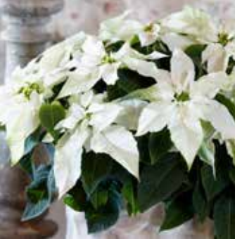
Share the joy.