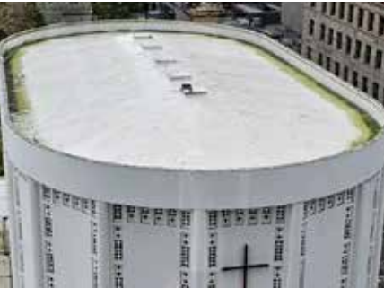
Water accumulating on the Sanctuary roof.

November is a time of gratitude and rainfall in Seattle. With that in mind, let us recognize the work of our amazing Plymouth Custodial Team. On Saturday, October 26, Rogie Eclipse noticed water dripping from the ceiling of the Sanctuary