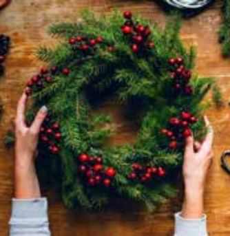
Join friends to prepare for the season.