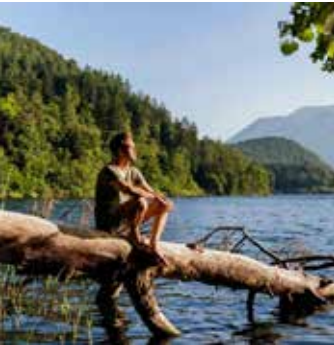
Men's Retreat at Pilgrim Firs Jan. 31-Feb. 2