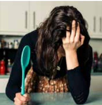
You are not alone: reach out for help.

If you or someone you know is struggling, dial 988 to connect with trained mental health professionals. The Lifeline is available for everyone. Get help for yourself, or be the vital difference for a loved one. 🌍