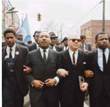
Learn about Bloody Sunday March 6-14, 2025.

than 50 state troopers, horses, and possemen, who brutally attacked them when they refused to turn back. This shocking event was broadcast nationwide, revealing the grim reality of racism in the South. Two weeks later, Rev. Dr. Martin Luther King Jr. led 3,200 civil rights activists on a historic 49-mile march from Selma to Montgomery, helping spur the passage of the Voting Rights Act. Details and registration link in the news article at PlymouthChurchSeattle.org . 🌍