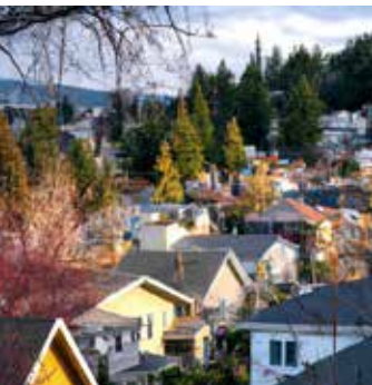
Housing sought for Afghan siblings.

The Plymouth Welcome Circle is excited to announce that the Afghan family we have been supporting has been selected for a voucher through the Seattle Housing Authority to help pay their rent. The family is asking for your help to find a 4 bedroom, 2 bath house for their family of 8 within the Seattle city limits.