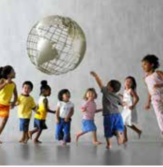
November 20 is World Children's Day.

World Children's Day was first established in 1954 as Universal Children's Day and is celebrated on November 20 each year to promote international togetherness, awareness of issues among children worldwide, and improving children's welfare. World Children's Day also marks the anniversary of the date that the UN General Assembly adopted Declaration of the Rights of the Child in 1959 and the Convention on the Rights of the Child in 1989.