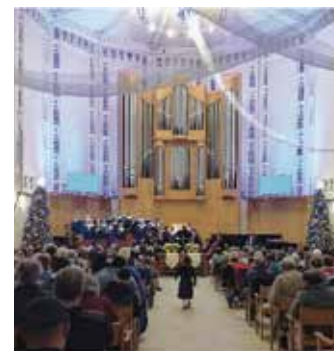
Service at 6:30 pm Tuesday, Dec. 24

Christmas will be here soon! Join Plymouth in celebration Christmas Eve, Tuesday, December 24, in the Sanctuary and live online at 6:30 pm. Service features beloved congregational carols, stirring anthems, moving Scripture and contemporary readings, and sharing of the light. Invite friends and family!