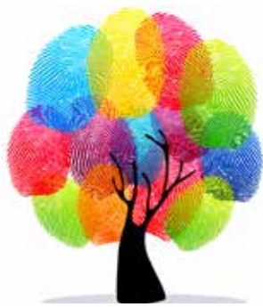
Celebrate and defend human rights.

For some cultures, December marks the season for holidays. Christmas, Hanukkah, Kwanzaa, and Milad un Nabi are just a few of the celebrations that American citizens will commemorate this month – not to mention the closing of the calendar year. But December is also observed for another reason: it is the Universal Month for Human Rights.