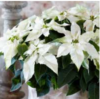
Spread the joy of the season.

Continue our tradition of delivering cheerful Christmas flowers to Plymouth folks who are isolated or have suffered a loss. Please come to church on December 15 and 22, pick up a card(s) and plant(s) to deliver at any time that is convenient.