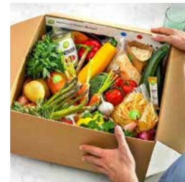
Prepare boxes at Plymouth December 18.