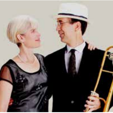
Concert 4 pm December 21 at Plymouth.