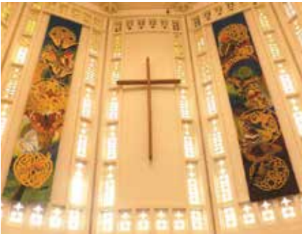
We give thanks for your faithful support.

As we near the end of 2024, Plymouth UCC invites you to consider a year-end donation to help sustain vital ministries. Your generosity enables our vital work in the community and beyond to continue. Here are ways you can donate: