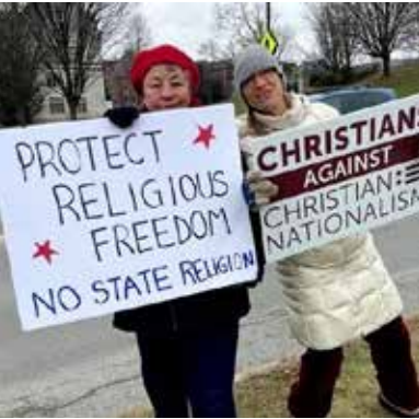
Stand up, speak out, share the Good News!

Christian Nationalism is a political ideology advancing the myth that the United States was established as a Christian nation and should continue as such. This belief system intertwines faith with political identity and is deeply rooted in ideologies that run counter to the life and teachings of Jesus. It is crucial for concerned Christians to provide a strong and clear counter-narrative, emphasizing that genuine Christianity is centered on loving God and neighbor, values that often stand in stark contrast to those promoted by Christian Nationalism.