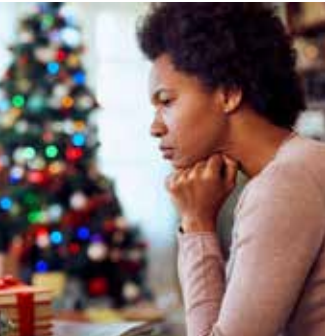
You are not alone: reach out for help.