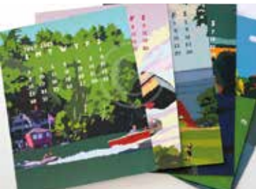
A small act of giving that brings great joy.