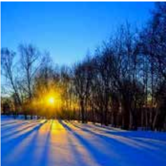
7:30 pm December 17 at Plymouth

7:30 pm Saturday, December 17, at Plymouth UCC