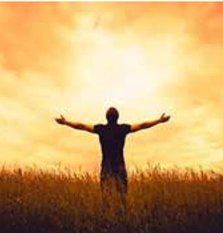
Retreat February 3-5 at Pilgrim Firs.

Tickets are pay-as-you can, $25 suggested donation, available online and at the door: ChoralArtsNW.org. ✨