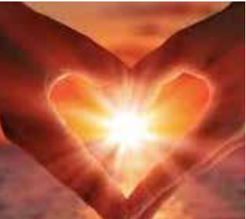
Let us know what we can do for you.

Your Plymouth Care Team is committed to responding to all care concerns that come our way. Please use the Plymouth Care Line phone number to get in touch with the Care Team should anything arise: 206.639.7739. Messages are checked at least once a day and the Care Team makes every attempt to follow up as soon as we are able. Please call and leave a message if there is something you need help with, or feel we should be aware of. The Plymouth Care Line is for non-emergency issues. For acute crises, call 988 or text “Home” to the Crisis Care Line at 741741. Members of the Care Team are: