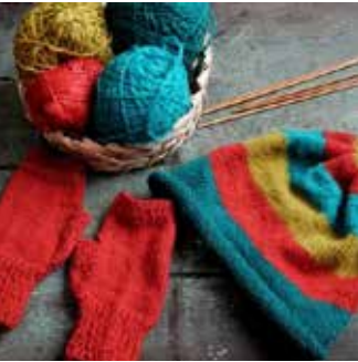
Hats and gloves needed!

Help contribute to the welcoming and warming of 24 Central American refugees this Christmas season. If you are a knitter and have a warm hat, gloves or scarves in your knitting fingers, please add them to the box at the entry to the Sanctuary until Christmas as gifts to our ‘families’ on New Year’s Day.