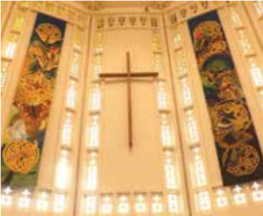
Thank you for your faithful giving.