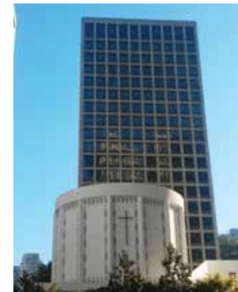
Meeting and vote after worship January 8.

The Plymouth Church Council encourages all to join the upcoming Congregational Vote on the Exploratory Development Committee's recommendation, January 8, 2023 , after Worship in Hildebrand Hall and live online.