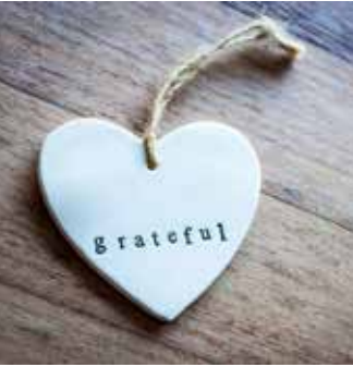
Retreat February 3-5 at Pilgrim Firs.

Of course, our retreat must comply with state, local and conference center guidelines. We’ll provide more details as we get closer to the date. We hope for safe travels and look forward to a fun and meaningful retreat. ✨