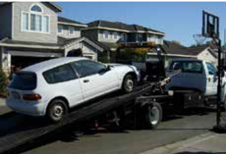
It’s quick and easy! Visit CarEasy.org