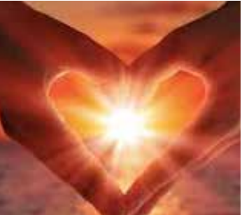
Let us know what we can do for you.

Your Plymouth Care Team is committed to responding to all care concerns that come our way. Please use the Plymouth Care Line phone number to get in touch with the Care Team: 206.639.7739. Messages are checked at least once a day. The Plymouth Care Line is for non-emergency issues. For acute crises, call or text 988. Members of the Care Team are: