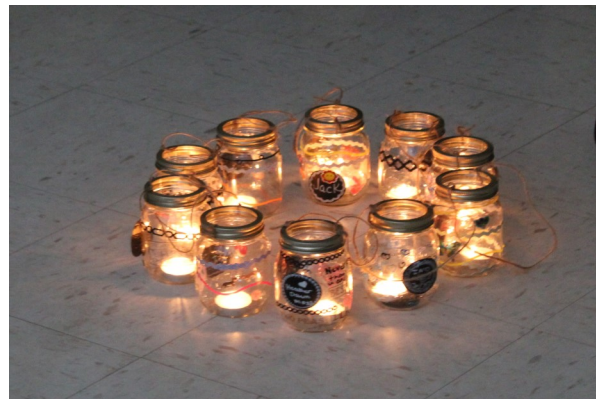
Memorial of Loved Ones