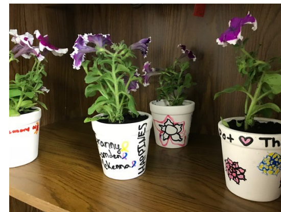
Expressive Art Activities