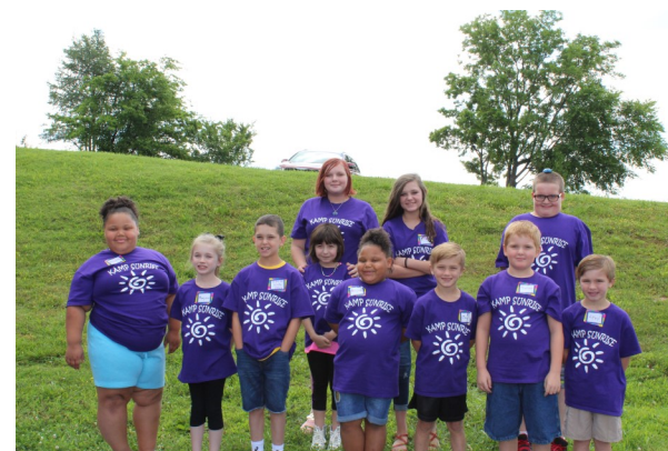
Kamp Sunrise 2017