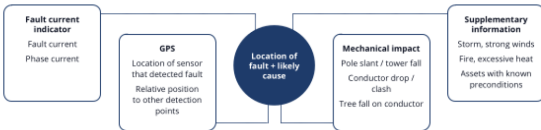
Figure 2: How GridVisor enables Fast fault response

The key differentiator of GridVisor from existing FCIs and power line sensors, is that it combines information derived from vibration-based sensing and situational awareness filling information straight into the SCADA system.