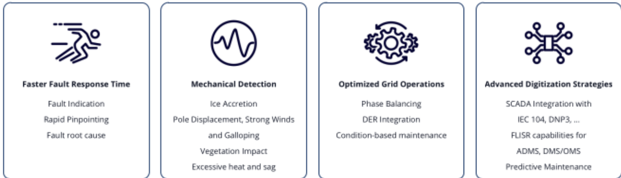
Figure 1: Capabilities enabled by GridVisor