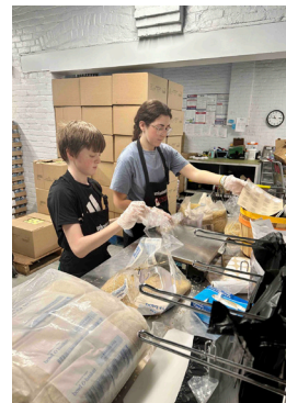
Revitalized in God's Love! Needed: YOU!