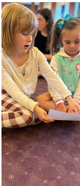
Roots, STRONG and deep . New growth.