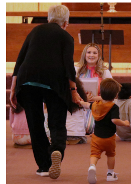
We make extending God's love TRADITION .