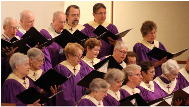
Hands and hearts celebrating God's LOVE .

Christ's body, hearts, hands, voices, feet.