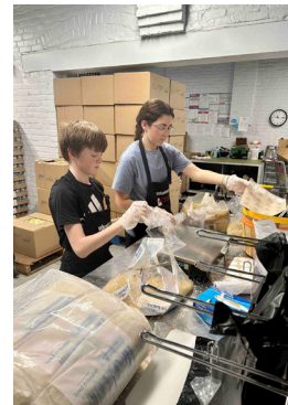
Revitalized in God's Love! Needed: YOU!