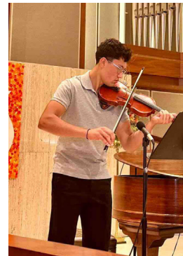
Roots, STRONG and deep . New growth.