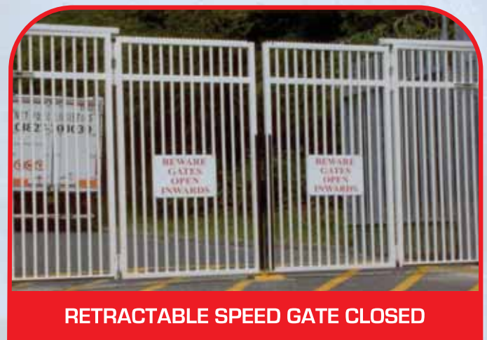
RETRACTABLE SPEED GATE CLOSED