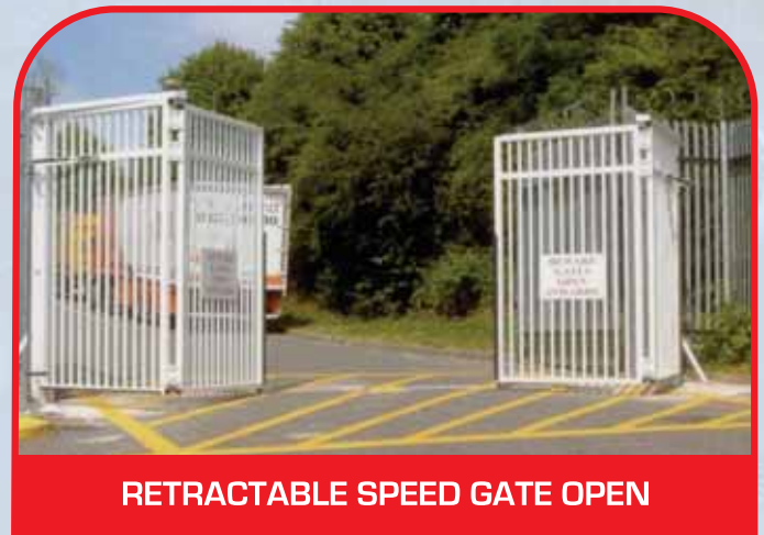
RETRACTABLE SPEED GATE OPEN

We specialise in the manufacture and distribution of Traffic Barriers, High Security Spike Barriers, Turnstiles (all types), Road Blockers, Magnetic Locks, Paraplegic Gates, Pedestrian Barriers, Bollards, Gooseneck Stands, Parking Control and Security Equipment.