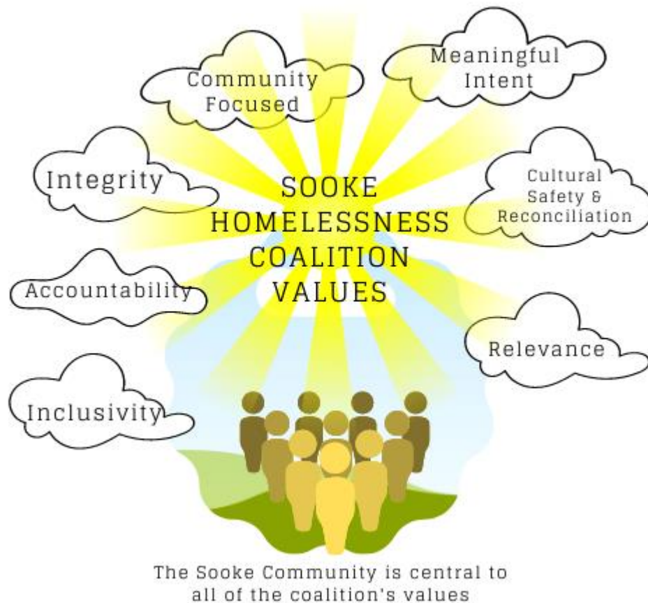
Figure 2: The Values of the Sooke Homelessness Coalition