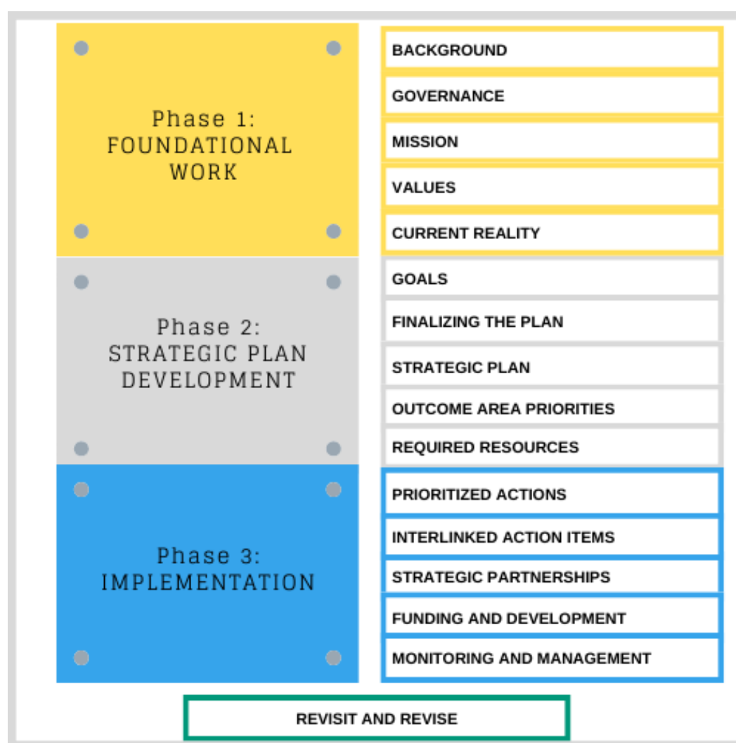
Figure 1: The Approach to the Strategic Plan

The third and final phase of this report features the 32 proposed action items that emerged from group discussion during the facilitated engagements. The SHC and its working group will determine stages of implementation as the plan is operationalized with a clear and steady focus on advocacy, strategic partnerships and collaborative working practice.