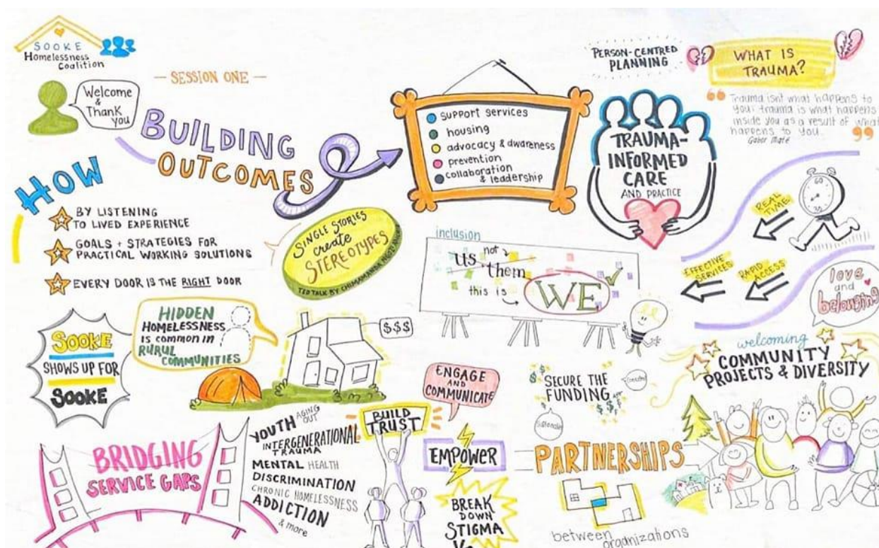
Figure 5: Graphic developed by Sooke Shelter Society employee Megan Kowal to capture the key themes and messages from the first community workshop