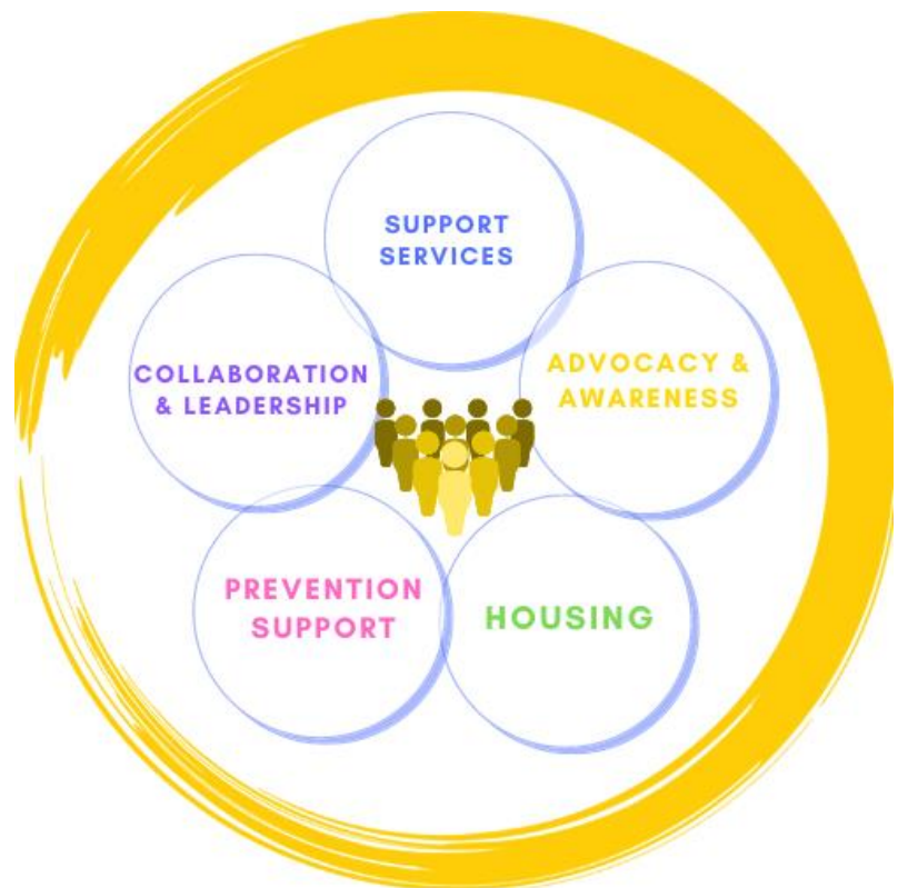
Figure 6: A non-directional interlinking relationship between the 5 key outcome areas, with the Sooke communities remaining central

Each of the community-based outcome areas were explored as separate categories in the engagement planning sessions. Action points are presented chronologically within each outcome area. However, in practice the implementation of these key strategies interconnect and overlap. Although separate processes may be needed for the implementation of the action points, they are mutually supportive of each other. When all the outcome areas are developed, this will create greater opportunity for the homelessness communities in the Sooke region to experience positive outcomes.