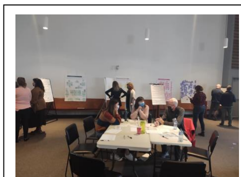
Figure 4: Community stakeholders during the community engagement session

Time was spent identifying funding sources and exploring how to generate community buy-in. There was also considerable appreciation expressed for the past and ongoing work of existing organizations and individuals that have done so much to address homelessness in the Sooke region.