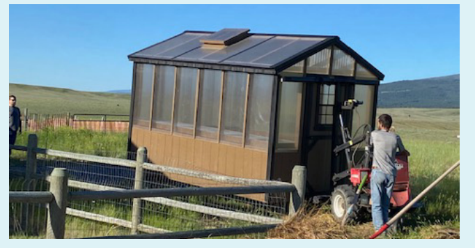
Thank you to Montana Shed Center for donating two beautiful greenhouses to our program!