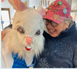
The Easter Bunny visited!