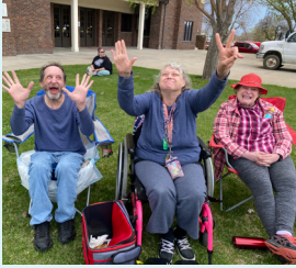
Enjoying the Vigilante Day Parade