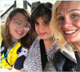
Went for a joy ride in the side-by-side!