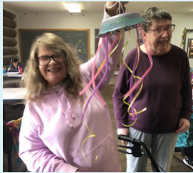
Making jellyfish crafts.