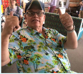
...and rainbow day!