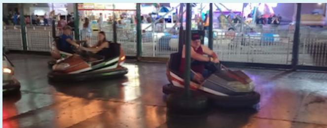
And we all had a fantastic time at the fair in Great Falls!