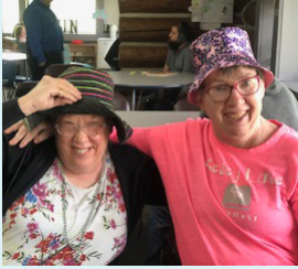
We enjoyed hat day...