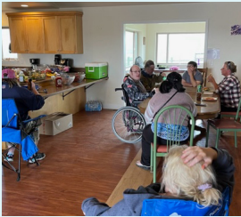
Went to a Memorial Day BBQ in Butte