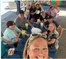
Had an awesome trip to Libby!