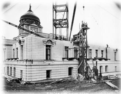
Capitol building construction (1910)

The 1894 Capital Election pitted the Copper Kings, Marcus Daly and W.A. Clark, against each other.