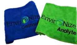
EnviroNize Catholyte™ Color Coded Micro Fibre Towels