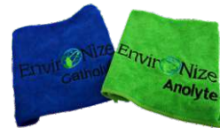
EnviroNize Catholyte™ Color Coded Micro Fibre Towels