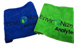
EnviroNize Catholyte™ Color Coded Micro Fibre Towels