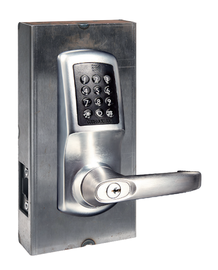
DD CL5500 Smart Lock

The standalone smart lock; innovatively designed by Codelocks to combine smart technology with traditional access control features. Heavy duty smart lock providing flexibility and convenience by offering advanced programming and access methods, allowing you to choose the most suitable for your application. Operate and manage locks directly via the keypad or via any Bluetooth compatible smartphone. All models include a clear protective cover.