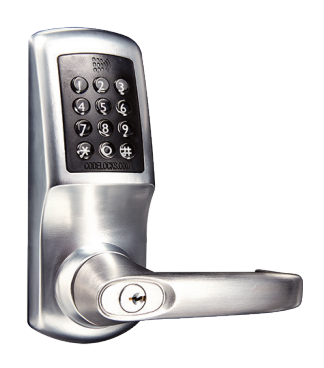
DDCL5510 Smart Lock

Gate Solutions by Codelocks can be ordered in two ways: as a complete kit with a gate box or as single lock