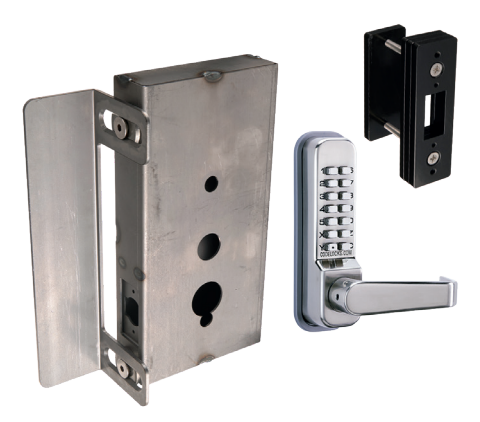
Industry exclusive kit includes: Gate Box, Lock, Latch Bracket & Stop Bracket

Contains all components required for a straightforward installation.