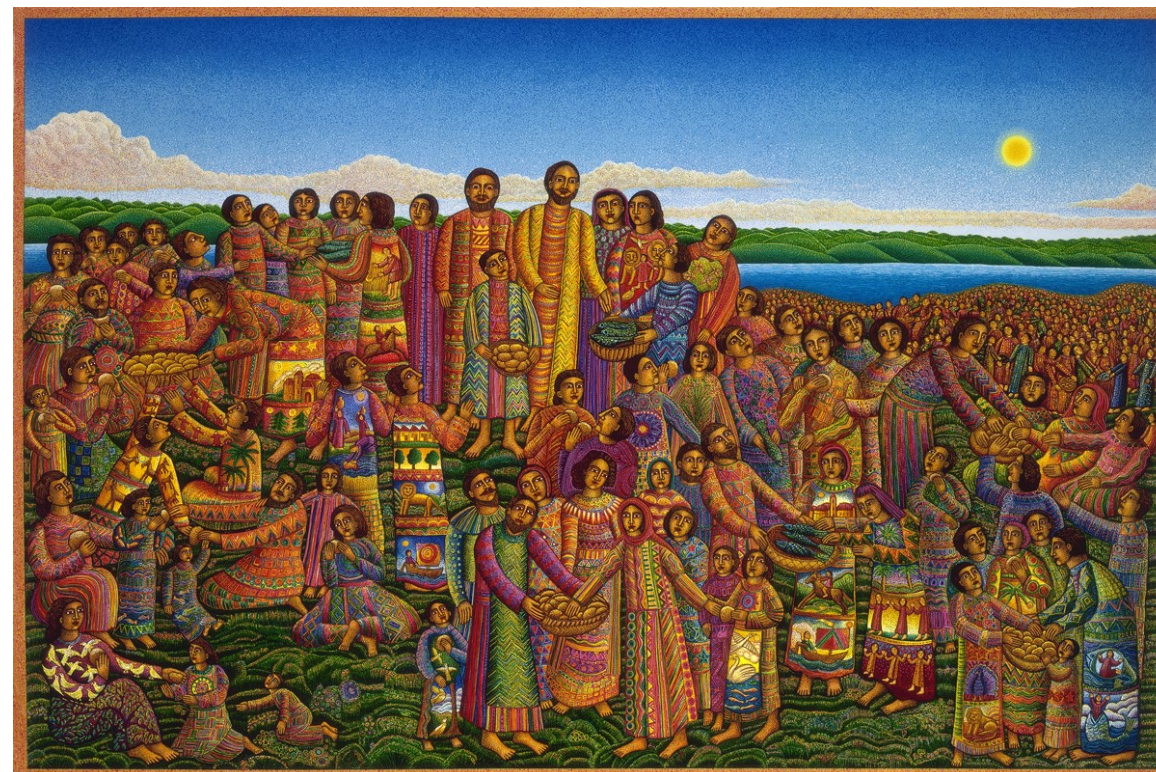
Loaves and Fishes