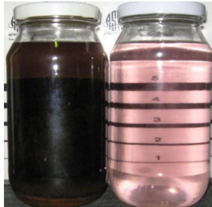
ULP before and after