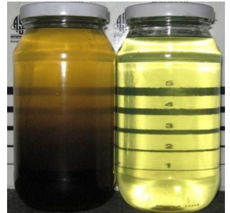
Diesel before and after