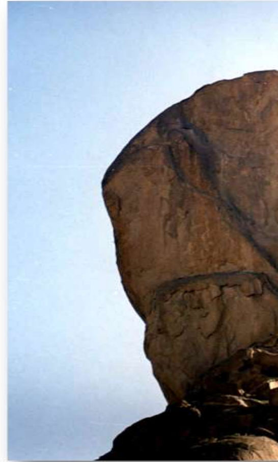
5. Elijah's Cave – Jezebel wanted to kill Elijah after the Mount Carmel miracle, where God brought fire