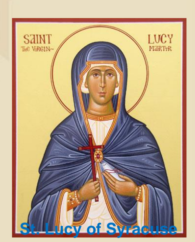
The League Intercessor