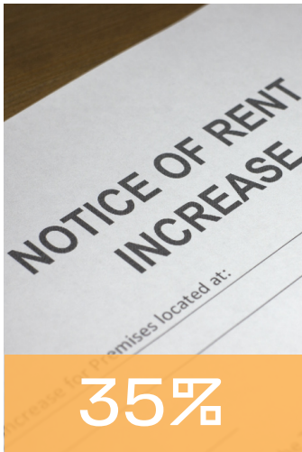
Increase cost in rent in one year- 5th highest in the US 2021-2022