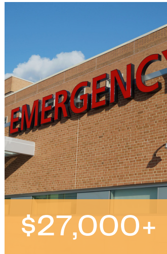
Average cost of emergency services for unsheltered individuals per year