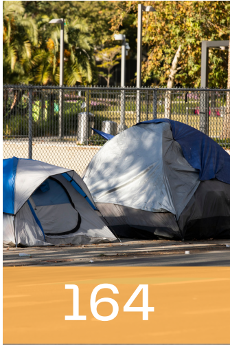
Unsheltered in Lewis and Clark County