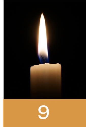
Unsheltered lives lost in 2023