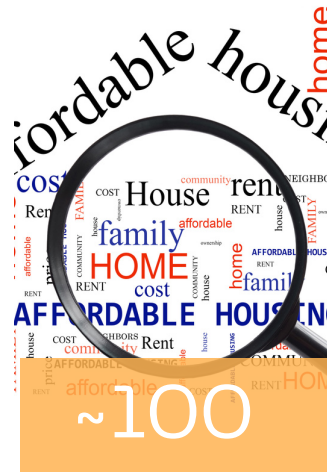
Individuals with Vouchers searching for housing