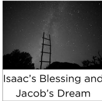
Isaac's Blessing and Jacob's Dream