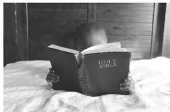
God Calls Samuel