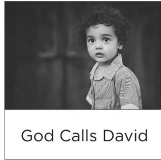
God Calls David