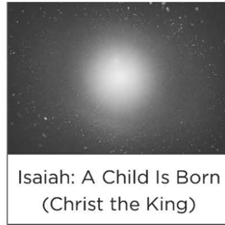
Isaiah: A Child Is Born (Christ the King)