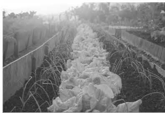
Jeremiah's Letter to Exiles (Advent 1)