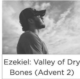
Ezekiel: Valley of Dry Bones (Advent 2)