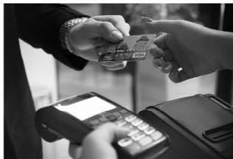
Jesus Cleanses the Temple