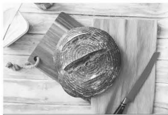
Bread of Life