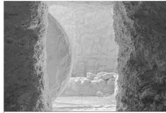
Jesus Raises Lazarus