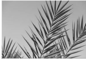
The Crucified Messiah (Palm/Passion Sunday)