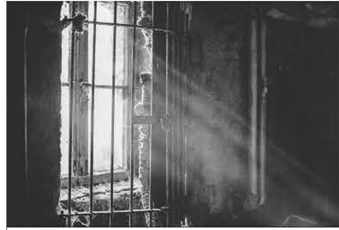
Paul and Silas