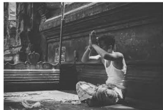
Partnership in the Gospel