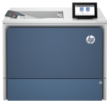
HP Color LaserJet Enterprise 5700dn Printer

This printer is intended to work only with cartridges that have a new or reused HP chip, and it uses dynamic security measures to block cartridges using a non-HP chip. Periodic firmware updates will maintain the effectiveness of these measures and block cartridges that previously worked. A reused HP chip enables the use of reused, remanufactured, and refilled cartridges. More at: http://www.hp.com/learn/ds