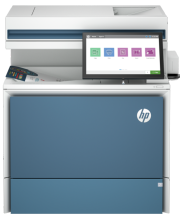
HP Color LaserJet Enterprise Flow MFP 5800zf Printer

This printer is intended to work only with cartridges that have a new or reused HP chip, and it uses dynamic security measures to block cartridges using a non-HP chip. Periodic firmware updates will maintain the effectiveness of these measures and block cartridges that previously worked. A reused HP chip enables the use of reused, remanufactured, and refilled cartridges. More at: http://www.hp.com/learn/ds